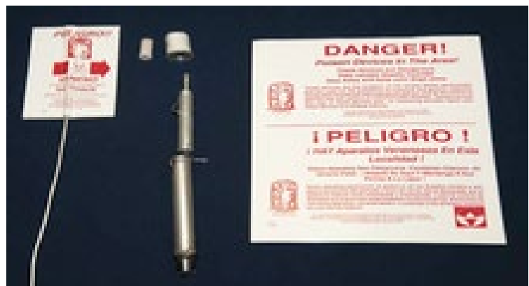
The M-44 consists of a capsule holder, a cyanide capsule, a spring-activated ejector, and a stake. Bilingual signs warn about the device.

The M-44 device uses a cyanide capsule that is registered as a restricted-use pesticide