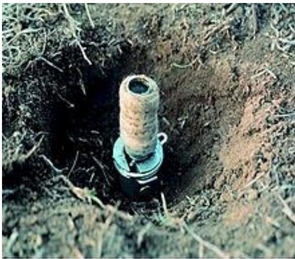
When the trap is set, only the capsule holder and capsule protrude above ground level.

The M44 cyanide device (also called a 'cyanide gun' or a 'cyanide trap') is used for the elimination of coyotes, feral dogs, and foxes. It is made from four parts: a capsule holder wrapped with cloth or other soft material, a small plastic capsule containing 0.88 grams of sodium cyanide, a spring-powered ejector, and a 5-7 inch stake. When the trap is triggered, the spring propels a dose of sodium cyanide into the animals' mouth, and the sodium cyanide combines with water in the mouth to produce poisonous cyanide gas. In addition to the cyanide, the capsule contains Day-Glo fluorescent particle marker (orange in capsules used by the Wildlife Service, and yellow in capsules prepared for other users).